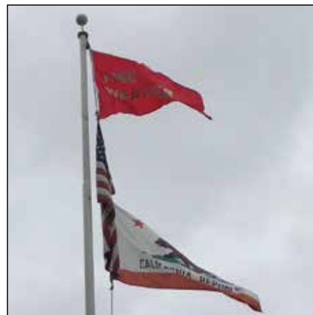
A red warning flag flying to indicate fire danger