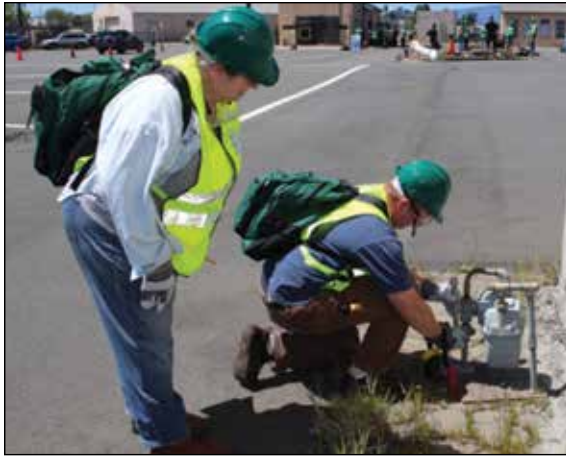
A CERT trainee learns about gas valve shutoff.