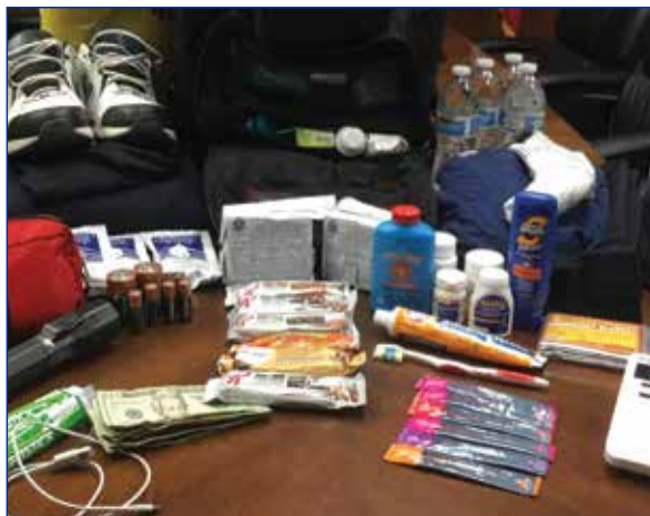
A sample Go-Bag kit. Have your Go-Bag ready in case you have to leave without warning.

The Contra Costa County Community Warning System (CWS) is another important information service. CWS will alert