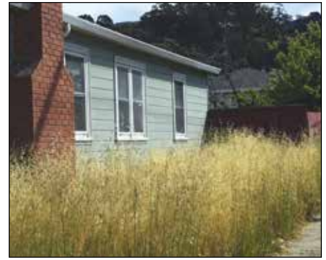
An example of potentially hazardous vegetation