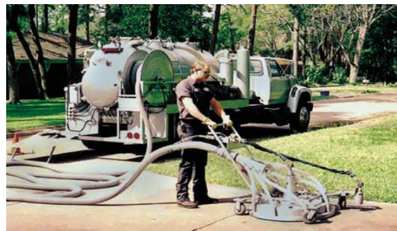
Specialist using a recovery system.