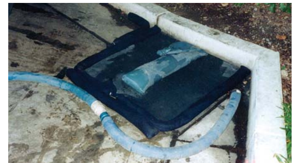
A storm drain cover with vacuum hose.