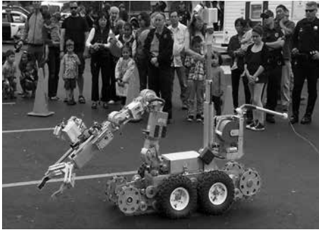
A bomb squad robot demonstration at last year's Tri-City Safety Day.