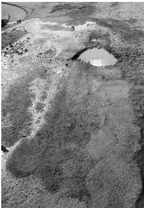
Deteriorating pavement and a rain-filled pothole show the condition of El Cerrito streets before Measure A improvements.

The Measure A Street Improvement Program is an investment by the community in El Cerrito’s future and a commitment by the City to maintain and enhance the quality of life for residents and businesses. Annual monitoring of expenditures is provided by the City’s Citizens’ Street Oversight Committee, in keeping with El Cerrito’s tradition of transparency and fiscal accountability, to