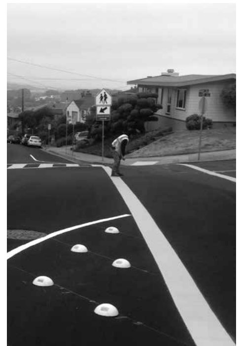
(top) Bulldozer applies a cape seal treatment as part of the 2013–14 Street Improvement Project. (bottom) New traffic striping and pavement markers.

ramps, and repaired 40 failing storm drains.