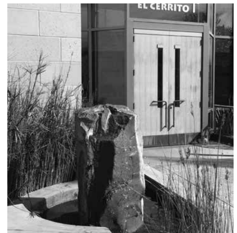
The recirculated water fountain at City Hall